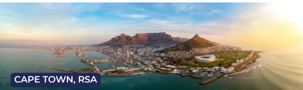
CAPE TOWN, RSA